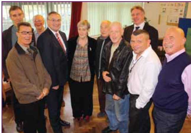
Alan Campbell with staff and members of the Opening Doors project

In September Age Concern Camden's (ACC) Henderson Court Resource Centre welcomed Home Office minister Alan Campbell, for the launch of the cross-government Hate Crime Action Plan, which sets out the government's strategic actions to tackle hate crime and support hate crime victims.